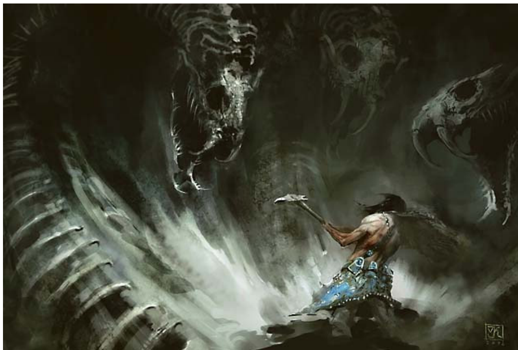
Death Rattle art by Vance Kovacs